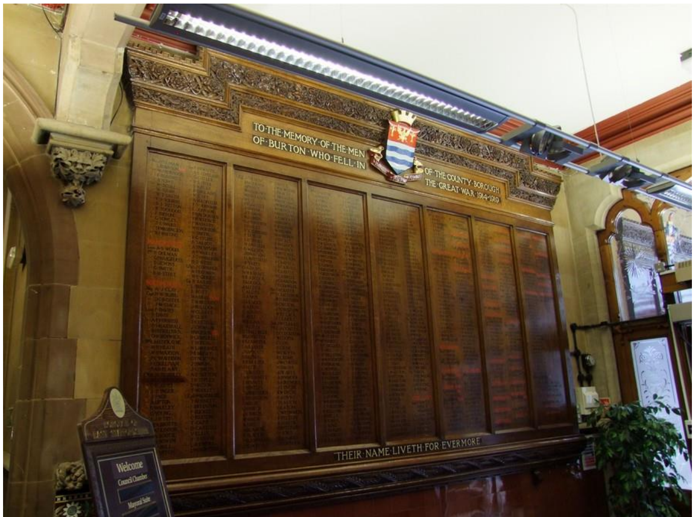
Burton Upon Trent Roll of Honour

W. Walkaden is remembered on Burton Upon Trent Roll of Honour, located at the entrance of the Town Hall, King Edward Place, Burton upon Trent, Staffordshire, England.