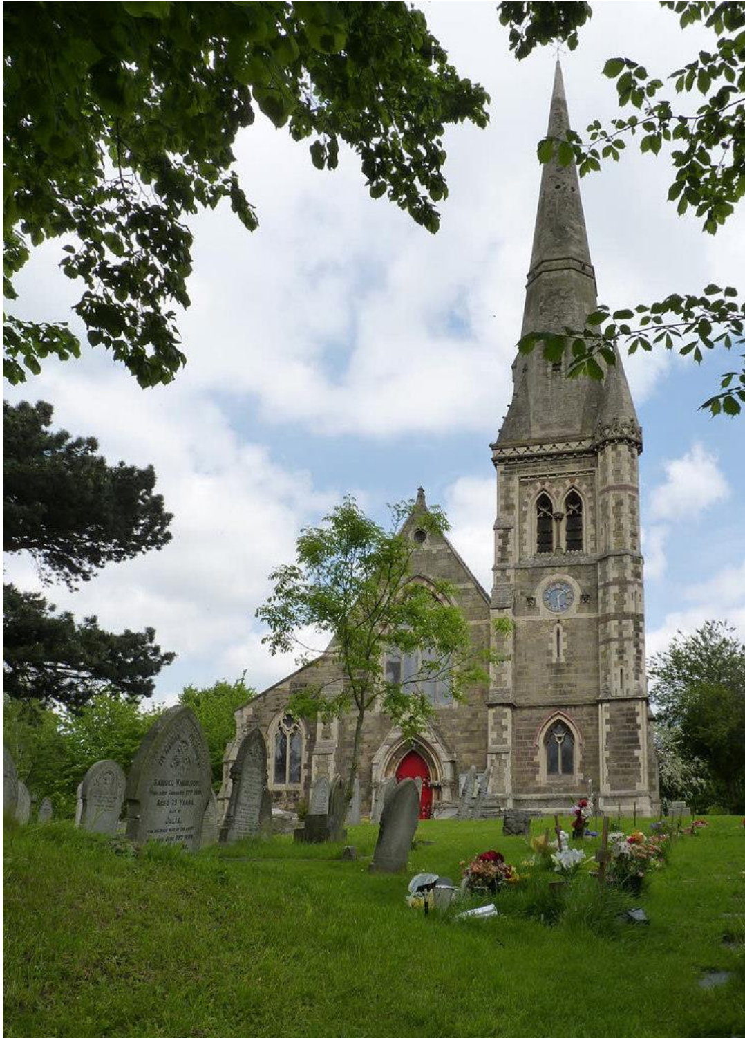
St. John the Divine, Horninglow