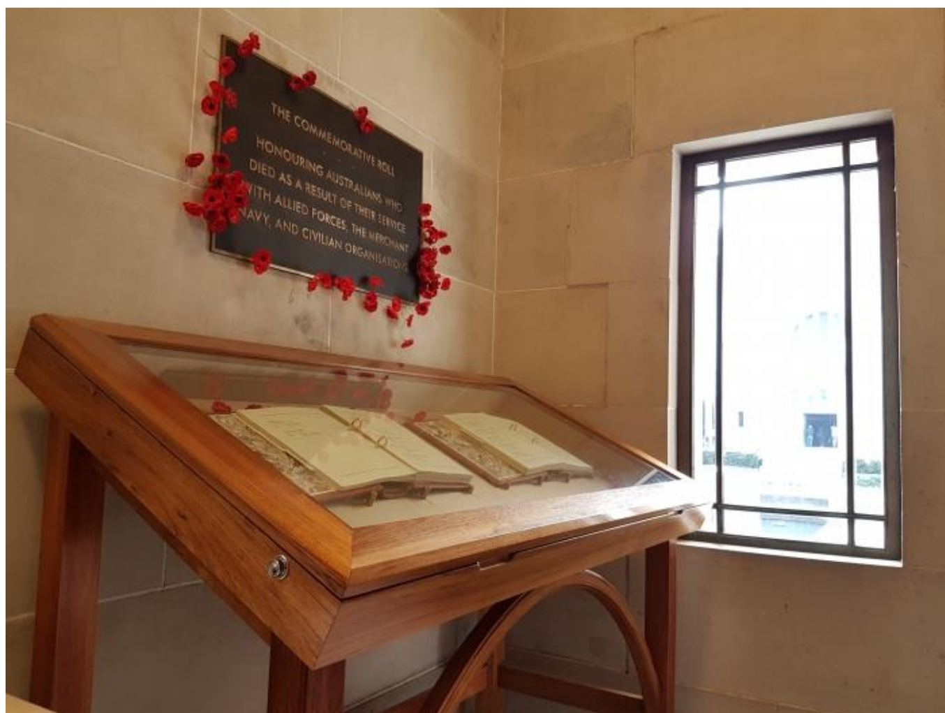
Commemorative Roll